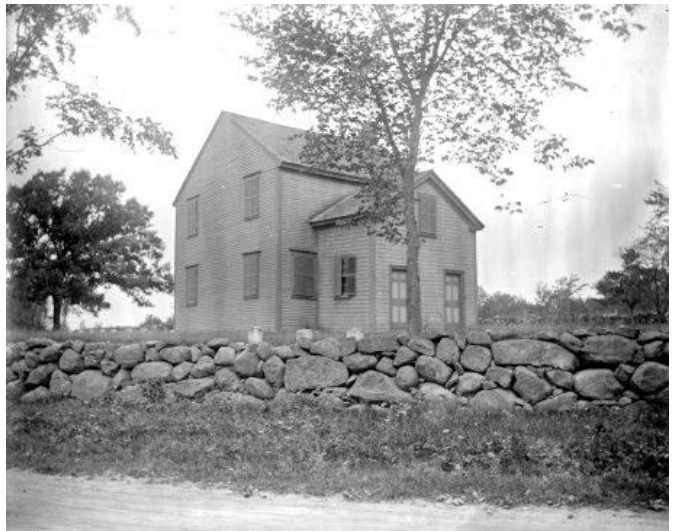
( November's "Unknown House")

The photo angles are different, but comparing the architectural features one by one, it is inescapable, they are identical!