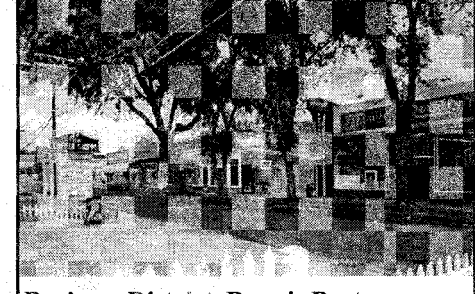
Business District, Dennis Port

Many of the old swamps and bogs were filled in before the Wetlands Act was established. That didn't eliminate the water, it simply moved it to another spot. Early Dennis Port settlers were very careful about locating their homesites on high ground. The Dennis Port section of the 1880 Barnstable County map shows where the high ground was—