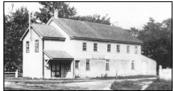
Liberty Hall, South Dennis

Once the church moved into the Liberty Hall building, it began to advertise its services and the size of the congregation grew tremendously. Due to this growth, a permanent place of worship was necessary. After an exhaustive search and through much prayer, in 1994 New Life Christian Center rented with an option to buy the Dennisport Theatre building on Route 28. After many hours of hard work by church members and friends and with a considerable amount of money invested, the members moved into their beautiful sanctuary on February 5, 1995. This year, 2000, New Life Christian Center purchased the building.