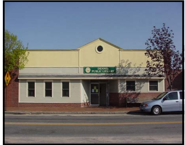
Dennis Public Library, Route 28, Dennisport

This concludes our series of articles on the Libraries of the Town of Dennis.