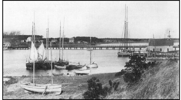
Early Lower Bass River Bridge From West Dennis