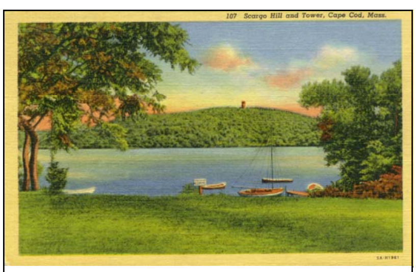
Scargo Hill and Tower From Marge Wheeler's Postcard Collection

Princess Scargo falls in love with Swift Deer, a visitor from another tribe. He wishes to marry her, but must prove his strength by fighting in battle. Before leaving he gives her a magic fish, promising to return when the fish is full grown. The magic fish can only live in fresh water. Since there are no fresh water lakes or ponds nearby, Princess Scargo's father. Chief Mashamiapaine calls a pow-wow to seek a solution. The tribe decides to dig with clam shells a large hole in the shape of a fish, and rains fill the hole. Thus according to legend, Scargo Lake is formed in its present shape of a fish and Scargo Hill grew up from the dirt that the Indians piled while digging the lake. Princess Scargo's fish