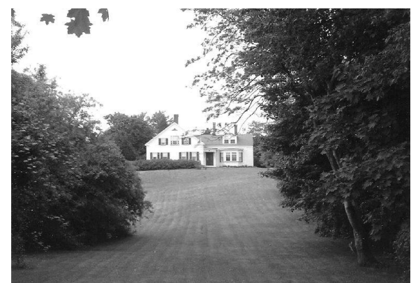
The house is now white, and the present (new?) owners have done a beautiful restoring it. A sign by the house says that it was built in 1812. The MA Historical Commission dates it as c1855. The aerial photo, looking east, shows the location of the house, marked with the X in a circle. The