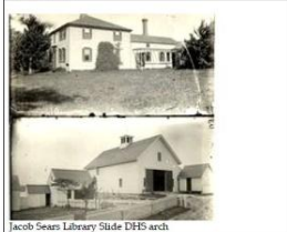
Jacob Sears Library Slide DHS arch