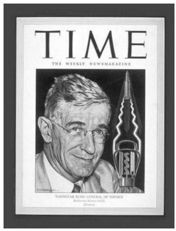
April 3 1944