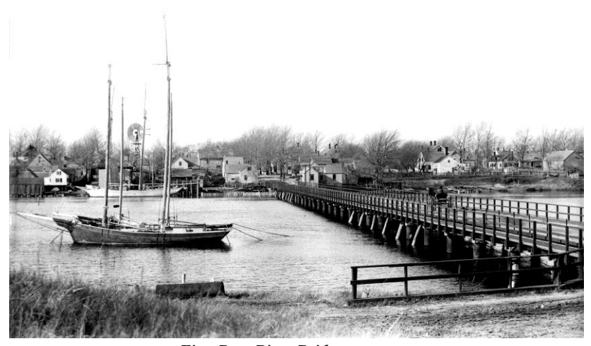
First Bass River Bridge

This remarkable image of the first Bass River Bridge, ca. 1893 is from the "loose and framed photos" found in the Jericho Barn. It was taken from the Dennis side of river looking west to South Yarmouth. Note the horse drawn buggy crossing the bridge, the schooner at anchor and across the river, a water pumping windmill and a second larger schooner tied to its dock. If one visits the spot from where the photo was taken at the corner of Route 28 and and Uncle Barnev's Road, there are a number of structures, both north and south of the bridge on Union Street and Pleasant Street, which are identifiable, either directly, or by their roof lines.