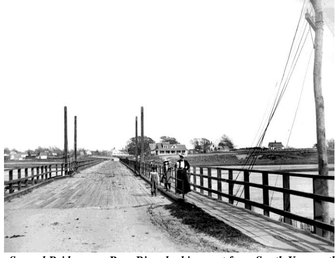
Second Bridge over Bass River looking east from South Yarmouth