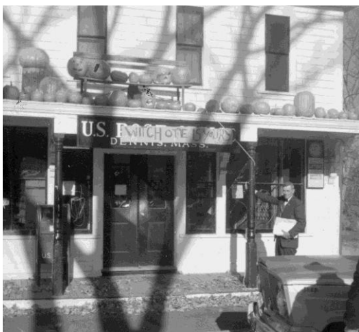
1965