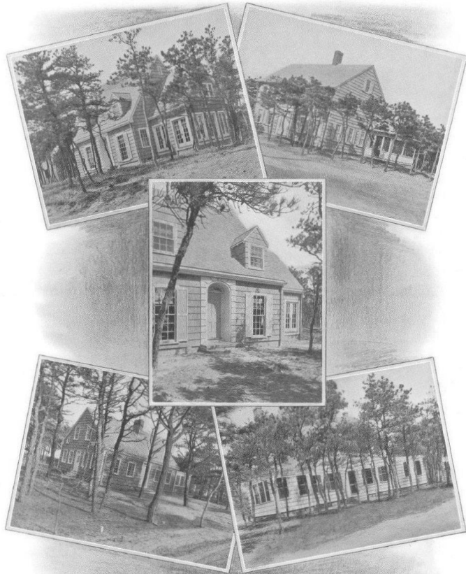
A FEW OF THE SUMMER HOMES BEING ERRECTED ON CAPE COD. NOTE THE QUIANT ARCHITECTURE, TRADITIONAL, YET INCLUDING ALL THE CONVENIENCES REQUIRED FOR A MODERN HOME