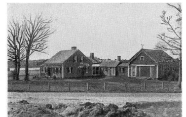
A TYPICAL CAPE COD HOME AS SEEN FROM THE ROADWAY

The topography at this point is ideal. The shoreline is formed by the silver sands of Miramar Beach, broken here and there by rifts of blue ocean where the deeper waters run in to form a cove or tiny harbor in which a yacht may be anchored, safe from any storm. Back from the beach are the little knolls covered with woods of pine and oak. A few miles to the north lies Cape Cod Bay, and across the cool waters of the Sound come the breezes that make the nights so pleasant.