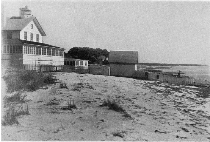
AN OLD CAPE COD LIGHTHOUSE ON THE SOUTH SHORE. IN THE BACKGROUND, TO THE RIGHT, IS MIRAMAR BEACH AND THE PARK