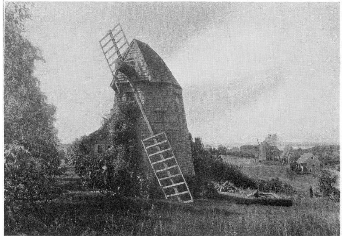
CAPE COD IS FAMOUS IN AMERICA AS THE HOME OF THE OLD WIND POWERED GRIST MILL. A FEW OF THESE MILLS REMAIN, THE MAJORITY WITHIN A SHORT RIDE OF MIRAMAR PARK

Cape Cod is rapidly becoming noted for its fine golf courses. Within half an hour's ride of Miramar Park are five of the eleven on the Cape.