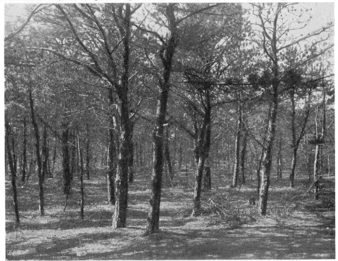
THE TREES ON MIRAMAR PARK AFTER THE UNDERBRUSH HAD BEEN CUT AWAY. GROWTH OF THIS NATURE PERMITS GREAT VARIETY OF LAYOUT OF GROUNDS AROUND THE HOME