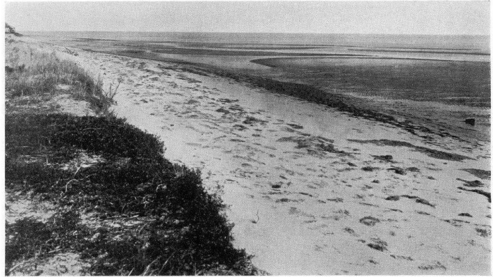
MIRAMAR BEACH AT LOW TIDE. THE FINE SANDY BOTTOM MAKES IT AN IDEAL BATHING BEACH

The climate at Miramar Park is wonderful. Equable and healthy at all times, it is greatly improved by the fine soil and plant life. The rich, sandy loam produces a growth which, in its turn, produces oxygen to keep the air pure and clean. The contour of the Dennisport area gives perfect drainage, an important factor in the selection of land. The days and nights are delightful in this neighborhood, and when other localities are suffering from heat or