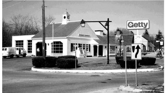
Dennis Garage, corner of Route 6A and Nobscussett Road