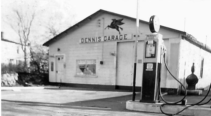
Dennis Garage, 777 Main Street

Subsequently, I learned from Carole that - The garage moved from 777 Main Street where the Homestead Condos are located to the Flying A Tidewater/Getty station in December of 1965. Cumberland Farm bought the site and thus began the battle to allow proposed changes to the site which would have included a convenience store and multiple self-serve gas islands. By 2005, through private fundraising and support at town meeting the building came down and Nobscussett Park was born.