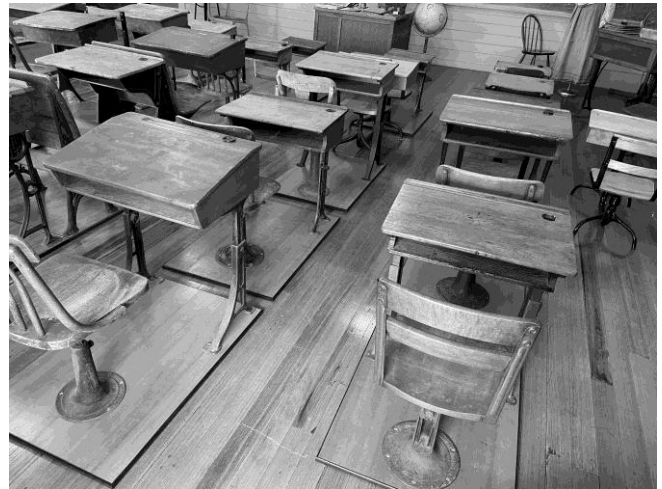
These photographs, taken by Bob Poskitt, show how beautifully the student desks and chairs are mounted on individual platforms.