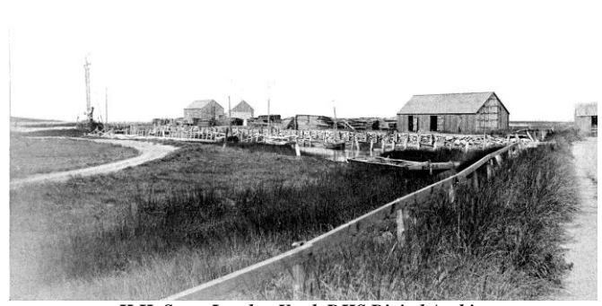
H.H. Sears Lumber Yard

Thank you for emailing and asking permission. You have provided all the information needed. Yes, you may use the photo. The only request is that you credit the source to be the Dennis Historical Society Digital Archive.