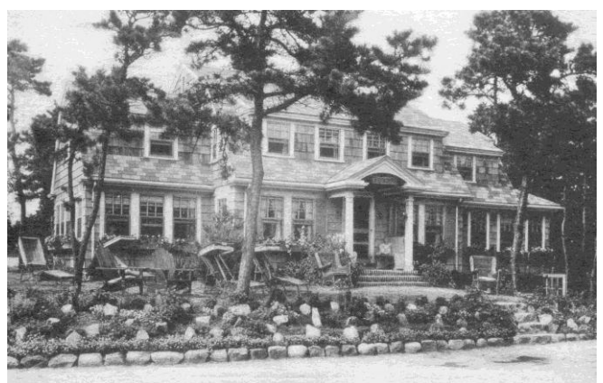
The "Edgewood" on Old Wharf Road