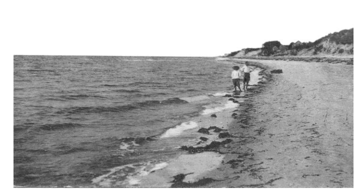
The Beach in Dennis Port