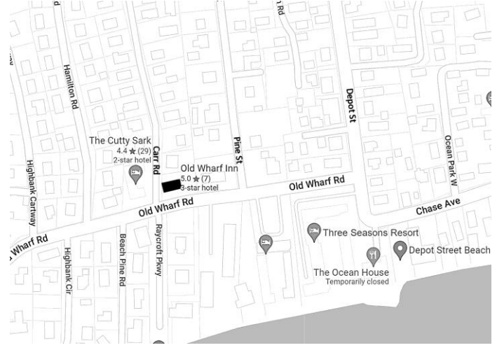
Old Wharf Inn in the offseason today.