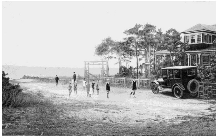
The Road to the Beach