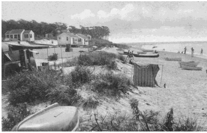
Grindell's Beach in Dennis Port