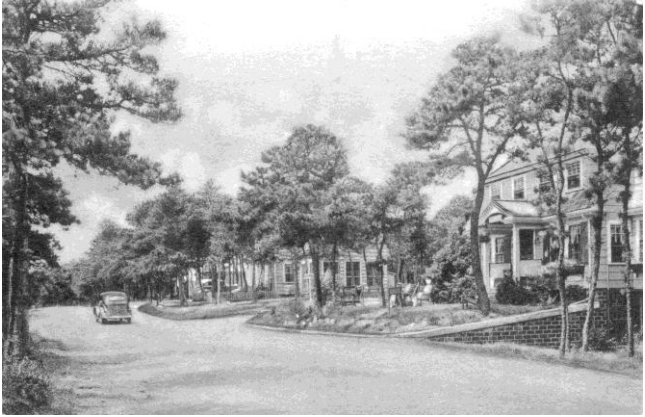
Old Wharf Road, looking west. The "Edgewood" is first on the right

His response had a nice bit of current information and the history of the development of the waterfront in Dennis Port.