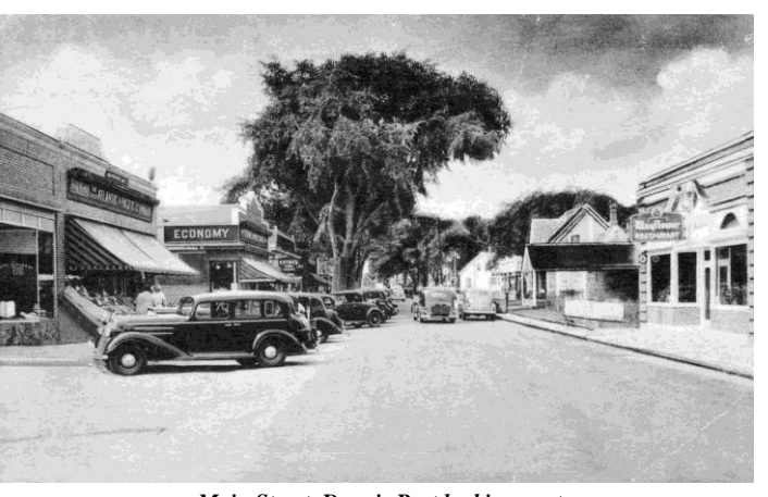
Main Street, Dennis Port looking west

Ed. Note – If you haven't visited the newly updated Digital Archive, please be sure to do so. On the top task bar of the DHS Website, click on Archive, then Access the Digital Archive >> You won't be disappointed!