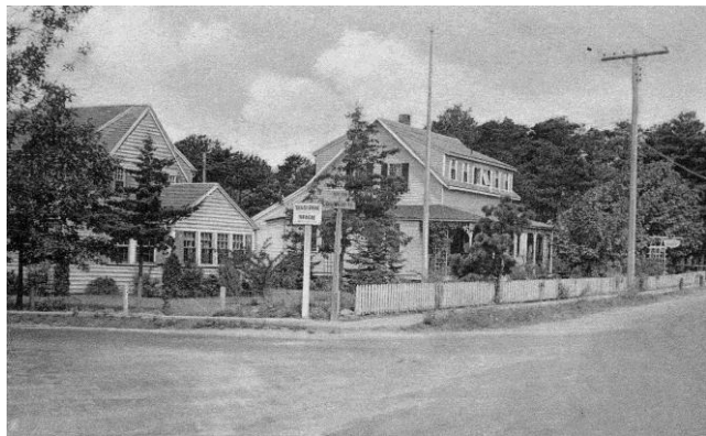
Corner of Depot Street & Old Wharf Road